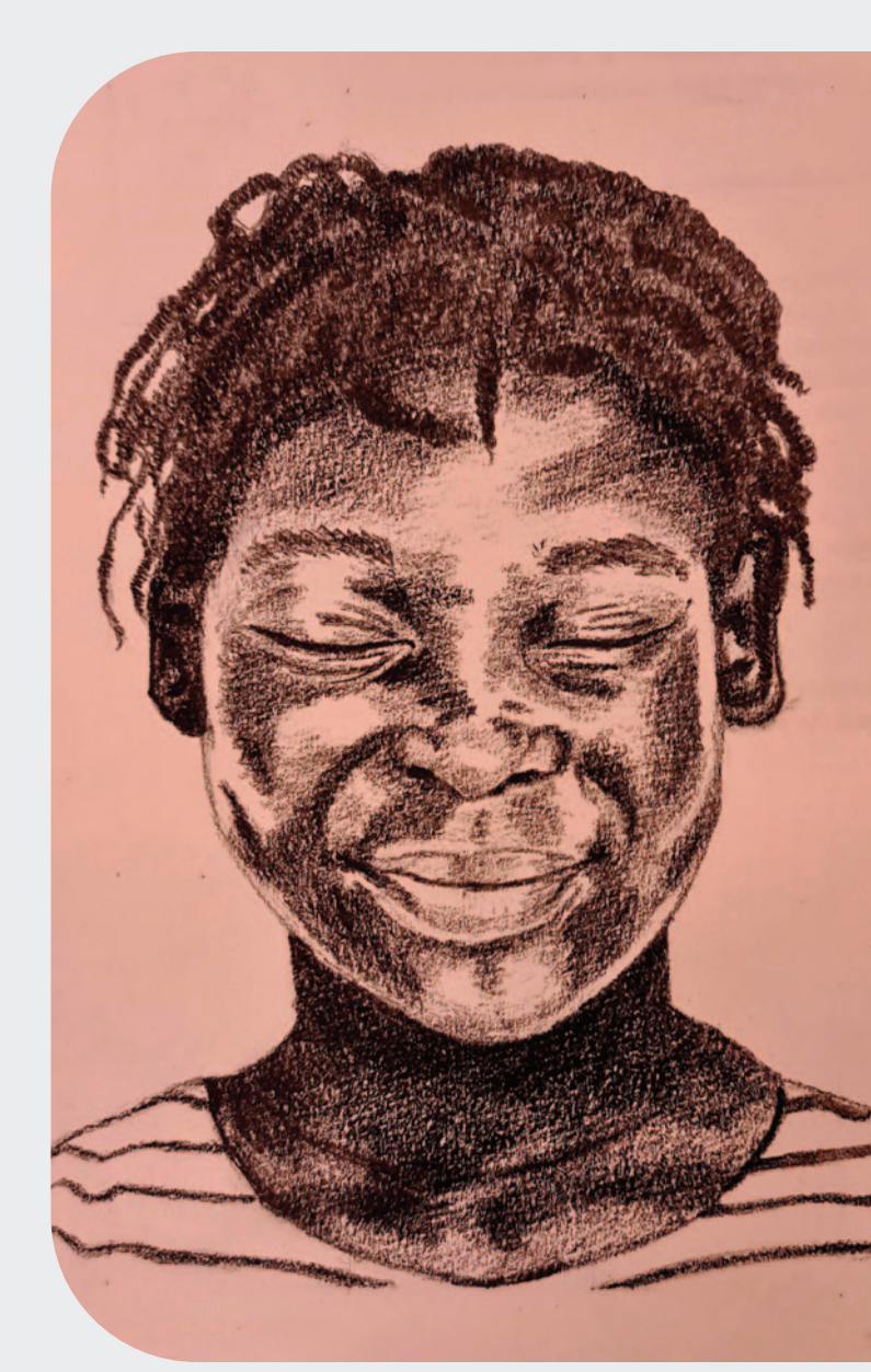
Artwork by Carrie Webb

24 weekly, three-hour creative arts courses in Trumpington, for disadvantaged residents, with the focus on mental health recovery.