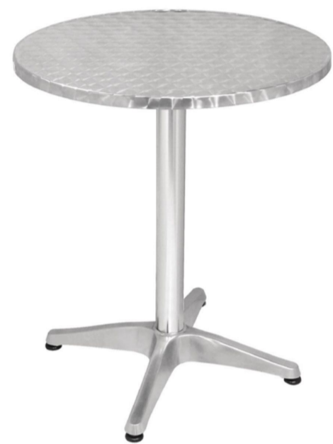
2. 600MM DIA METAL TABLE