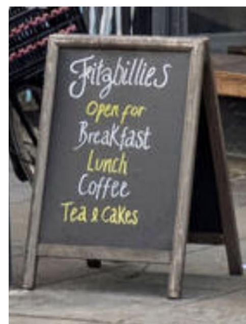
4. MOVABLE A-BOARD