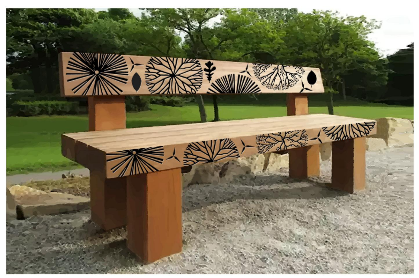
Eddeva Park - Public Art