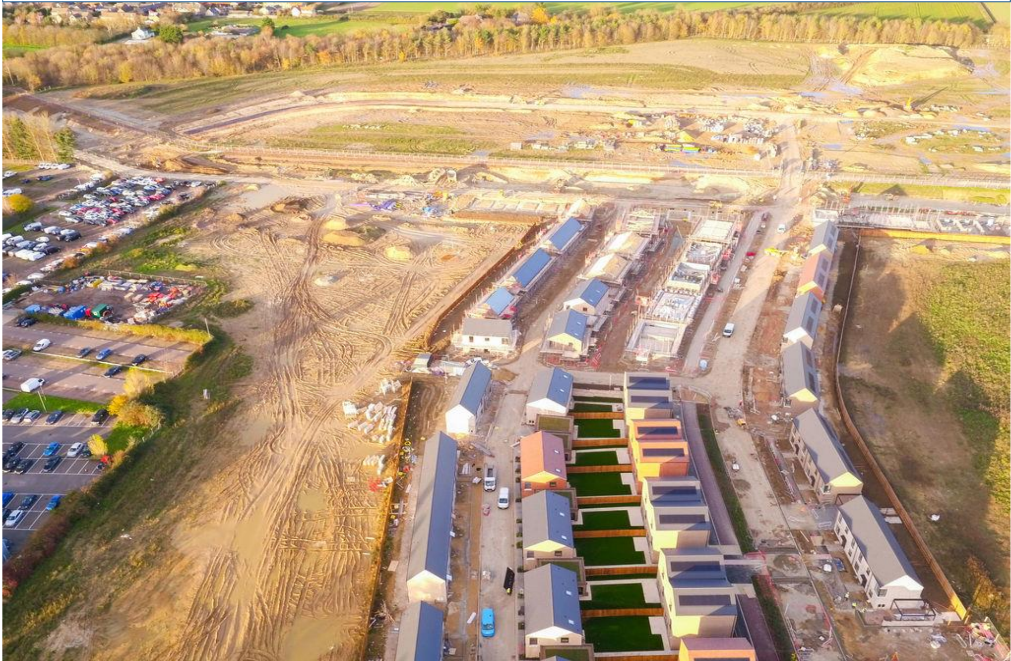
View looking north along Marleigh Avenue towards the phase 1b site