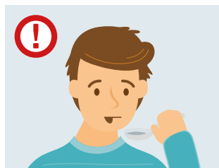
A change to or loss of your sense of taste and smell.