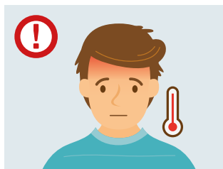
A high temperature