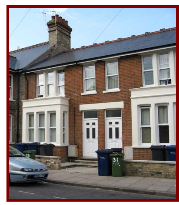
Nos. 29 – 39 (odd) Collier Road

An almost continuous terrace of two storey houses built using red brick with white brick chimneys. The roofs are covered in slate with decorative red terracotta ridge tiles. The principal feature is provided by a three window wide ground floor bay window to each property, all with sashes, which are reflected in the three sash windows which lie immediately above. Post 1886.