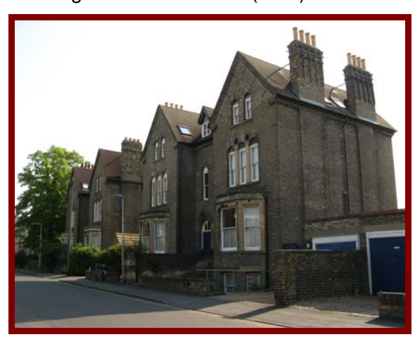
Throughout the Conservation Area there are also a number of warehouses and

There are only four listed buildings in the Conservation Area – St Matthew's Church, the Cemetery Lodge, the former Library in Mill Road, and Hughes Hall. Eight tombstones in the Cemetery are also individually listed. However, many of the better preserved and more prestigious houses (for instance, in the Collier Road area, Mortimer Road, and also in St Barnabas Road) are designated as Buildings of Local Interest (BLIs).