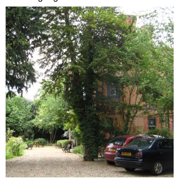
From the 1880s (one of the remaining buildings is dated 1882) a site to the north of Mill Road was developed as an Isolation Hospital.

the front parlour. Front bay windows were also added to the more up-market houses, often lived in by train drivers, who earned more than the more lowly railway workers. The 1886 maps also confirm the existence of two large houses, both set back from Mill Road. To the north, The Lodge occupied a large site between Cavendish Road and Sedgwick Street (which appears to have been totally redeveloped in the 1920s), and to the south, Romsey House, which may have given its name to the area. This survives on the corner of Coleridge Road and Mill Road and is currently used as a language school.