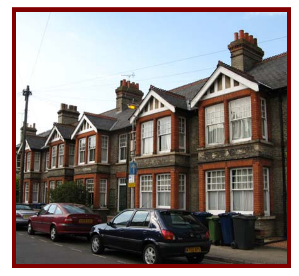
Nos. 1-3 have two storey bay windows, gault brick (or rendered) elevations, and slate roof (the same details as Nos. 19, 21 and 23 Willis Road). Nos. 5-13 are red and white gault brick with two storey square bay windows topped by a half-timbered gable, with sash windows below with twelve panes over one. Post 1886.