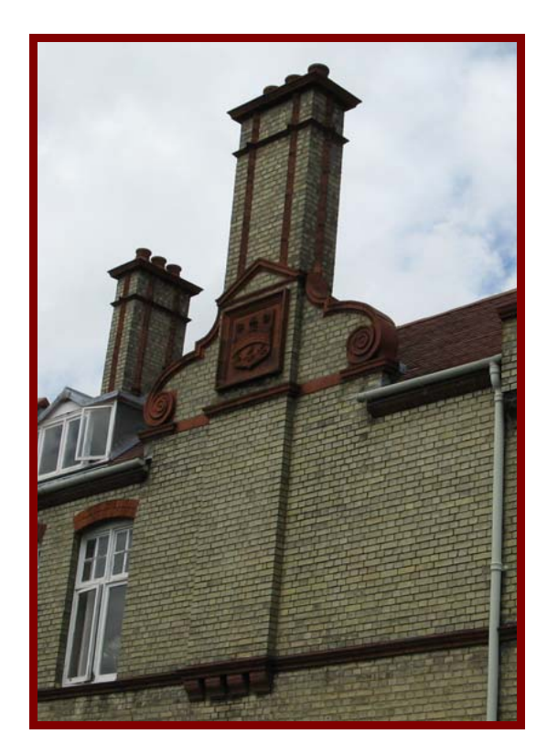
Mill Road Baptist Church, Mill Road