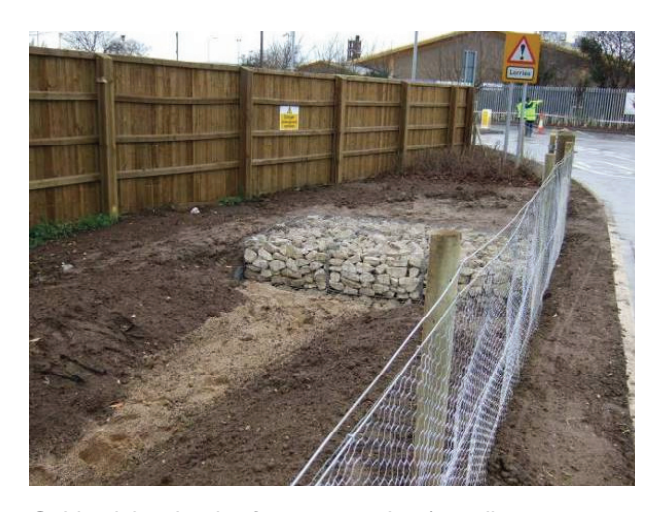
Gabion inlet shortly after construction (see diagram above)