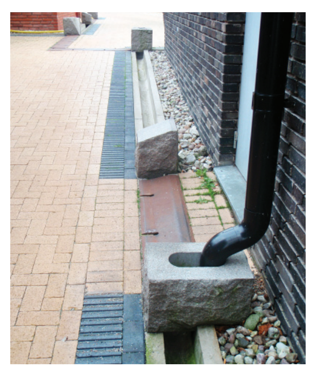
Shallow geocellular storage used below permeable paving as a subbase replacement