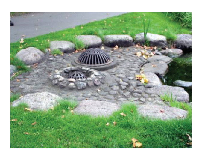
Overflow outlet from a pond