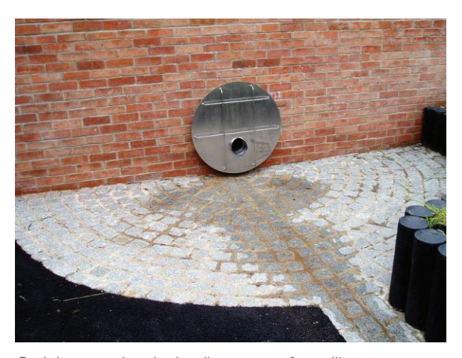
Stainless steel outlet leading to a surface rill

Inlets, outlets and controls are key elements of a well designed SUDS. They allow water to flow into and out of features and also limit the rate at which water flows along and out of the system. There are many different variations available and they can easily be designed to add interest to the urban landscape.