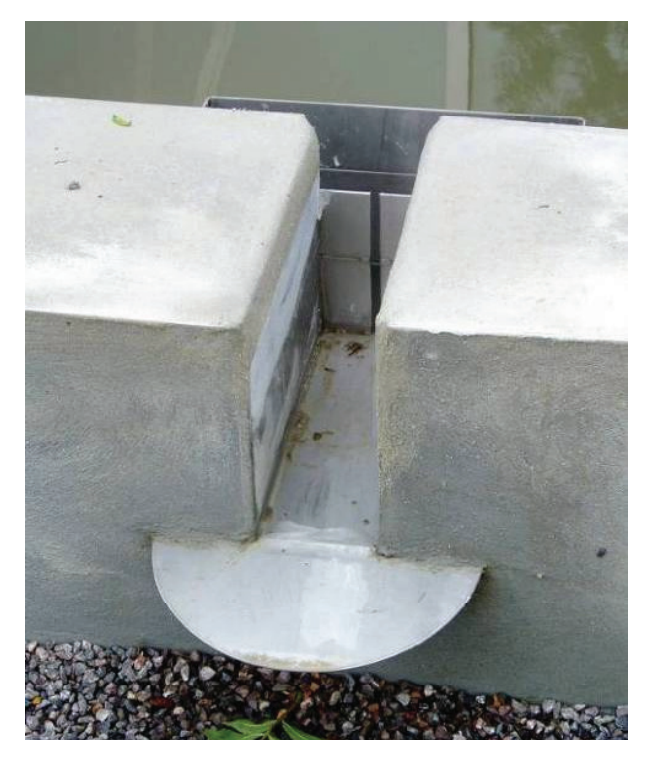
Slot weir outlet with steel plate to disperse water and debris guard behind