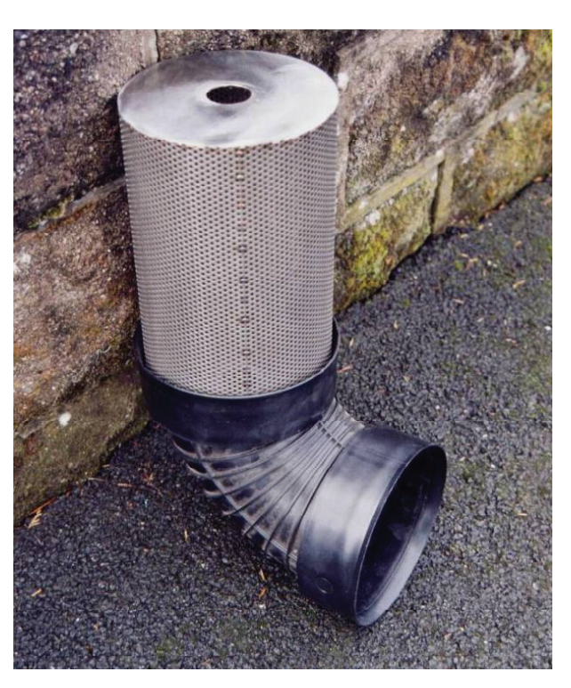
Perforated riser pipe to protect an orifice control in a chamber (see diagram above)