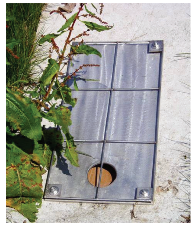
Orifice control to a basin located on the surface so that it is easily accessible