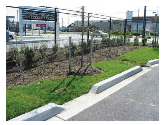
Dropped kerb inlet to rain garden