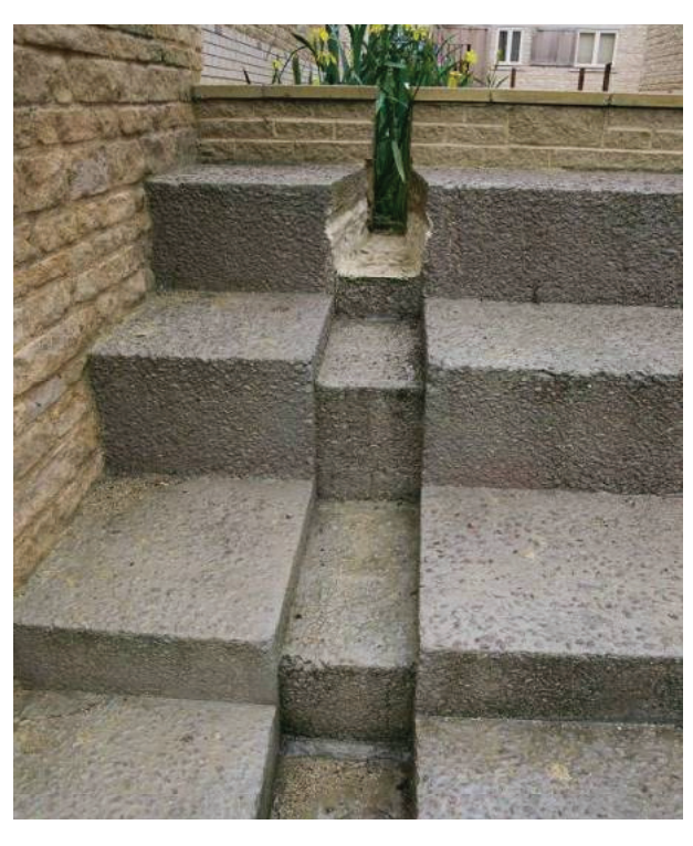
Slot weir outlet from a canal

For shallow systems, where there is a limited depth of water storage, simple orifice controls are often the most suitable form of control.