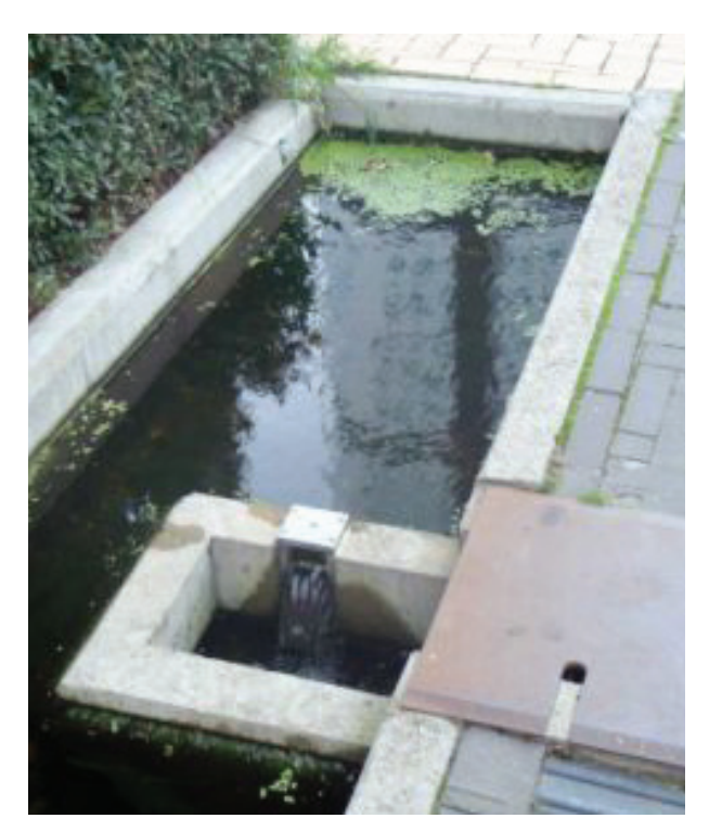
Outlet from a small urban SUDS water feature

Routine maintenance of inlets, outlets and controls involves a monthly inspection to make sure they are clear and not obstructed. Any debris, litter, etc. that has accumulated will require removal. The cost of doing this will normally be included in the cost for visiting a site to carry out other maintenance work.