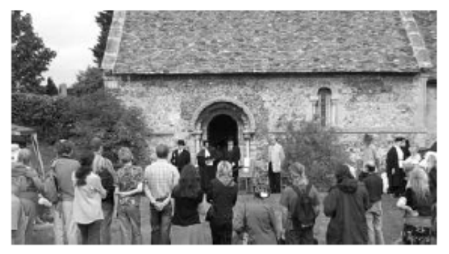
Figure 5 Stourbridge Fair re-enactment at the Leper Chapel

A major problem is that there are no formal requirements for highway authorities to have regard to the historic environment. The strategy for access to the Cambridge East growth area involves a major new bus route crossing Stourbridge Common and damaging the setting of the grade I listed mid 12th century Leper Chapel, the last surviving building associated with the great medieval Stourbridge Fair, and which has provided the