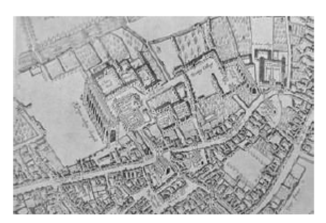
Figure 2 Extract from Hamond's 1592 plan

Cambridge's character is both historic and dynamic. Its historic character is itself a complex blend of dramatic change and evolution. When it was built, King's College Chapel was almost a medieval parallel to London's Canary Wharf in terms of dramatic docklands redevelopment: it towered over the town, and cut right across the former Milne Street (whose line survives to the north and south in King's Lane and Trinity Lane respectively). This street used to link the riverside hythes and wharves, through which much of the medieval town's trade passed. The river's trading character now survives only in 2 places: at Quayside by Magdalene Bridge, and at Mill Lane, which used to link the hythes and wharves of the town, much of whose trade had focused on the river.