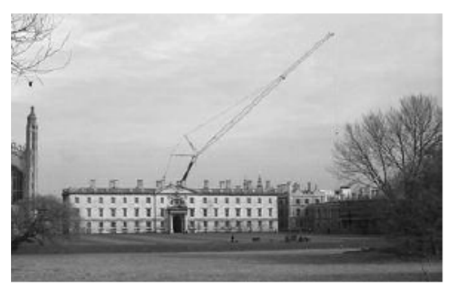
Figure 1 King's College Chapel and the Gibbs Building, with temporary crane beyond

Sometimes the contrasts are between perceptions and realities. The City Council's view of Cambridge is of a "compact historic city... surrounded by attractive green spaces...." (Cambridge Local Plan 2006, para 2.1). This view of the historic city as "compact" overlooks the historic significance of the whole river corridor running right through the city and its landscape setting, from Grantchester in the south (associations with punting, Byron, and Rupert Brooke among many) through Stourbridge Common (site of Stourbridge Fair, at its peak the largest fair in Europe) and north east (along the course of the University and Town rowing races) to Baits Bite Lock well beyond the city boundary. This landscape setting is a vital part of Cambridge's character. The seeming lack of consideration by the Council for the river landscape, so significant for students and visitors, is a vivid illustration of how different