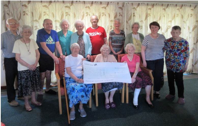
Tenants at Ditton Court present the cheque on behalf of all sheltered housing tenants