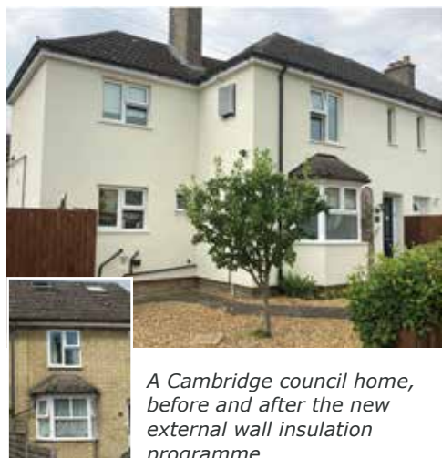
A Cambridge council home, before and after the new external wall insulation programme

The City Council has committed £3.6 million per year for the next 12 years to improve energy efficiency in council homes through external wall insulation. It also recently won £2.3 million of Social Housing Decarbonisation funding to help insulate 185 further homes in the next two years.