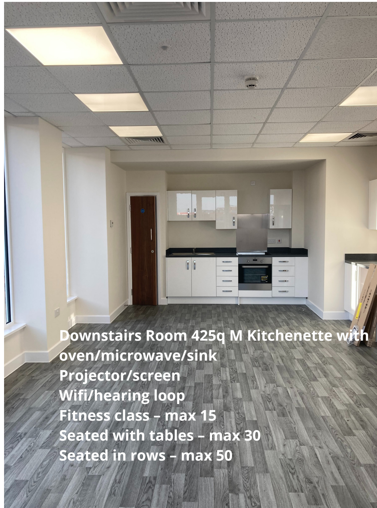
Room for Hire Downstairs