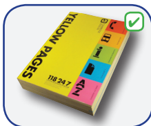
Phone books & catalogues