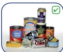
Cans & tins