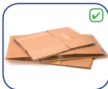
Large cardboard boxes All cardboard (flattened)