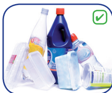
Plastic bottles, pots, tubs & trays