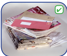
Paper, magazines & envelopes

ONLY ITEMS LISTED BELOW GO IN THE BLUE BINS, NO OTHER ITEMS PLEASE