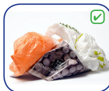
Plastic bags, film & wrapping