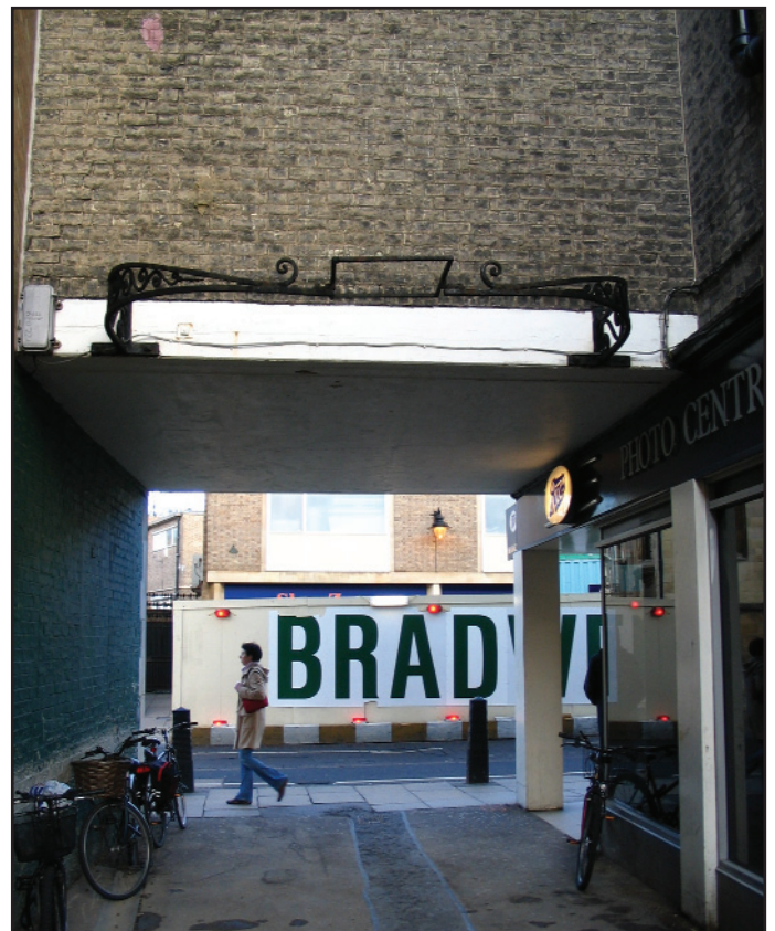
View through Post Office Terrace, lantern bracket from 'The Eagle' public house