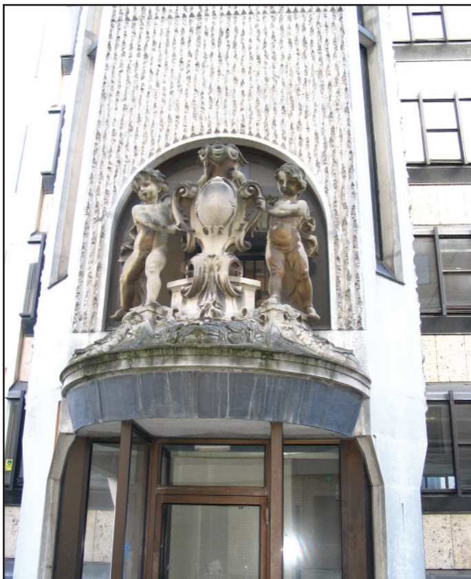
Baroque cartouche - Norwich Union building to be reinstated on Grand Arcade

The street is the route out for prisoners from the Magistrate's Court. Building uses include offices, hotel, court and car park.