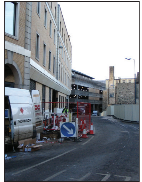
View along St Tibb's Row

was essentially open grazing land with the King's Ditch running across it. The massive redevelopment of the area in the C20 means that hardly anything from even the Victorian era survives. St Tibb's Row today is very much a service road and one which will be entirely redeveloped again under the Grand Arcade scheme.