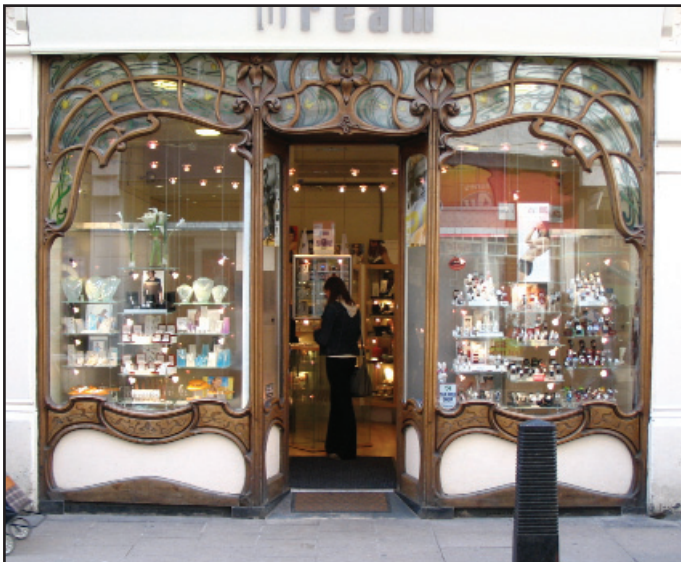
Art Nouveau shopfront, Market Street