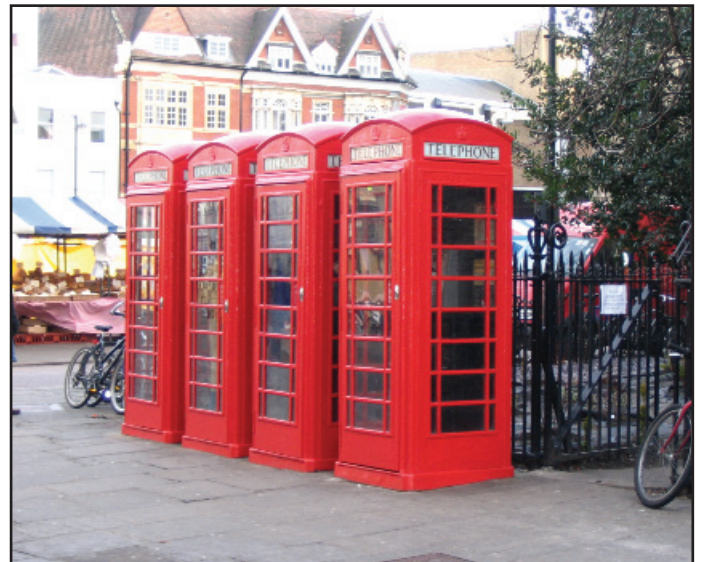
Old cast-iron telephone boxes, St Mary's Street