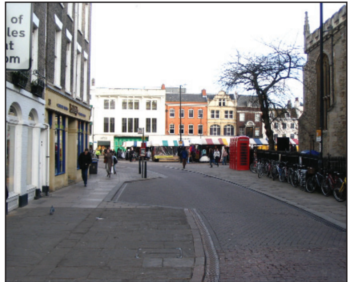
View along St Mary's Street