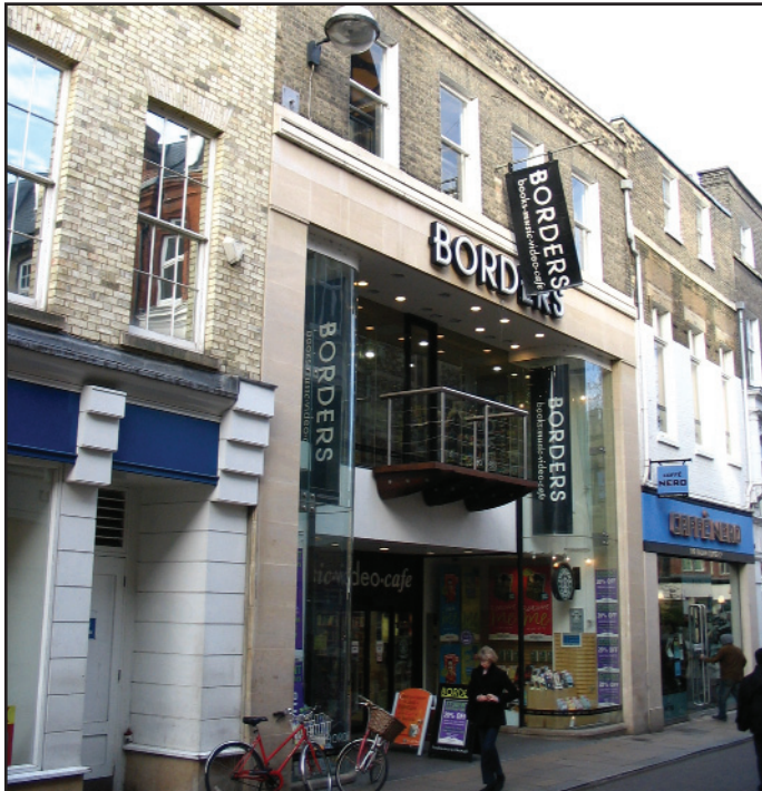
Borders, Market Street

Wholesale redevelopment of any building seems unlikely, but there may be some scope for encouraging more active use of the upper floors of some buildings.