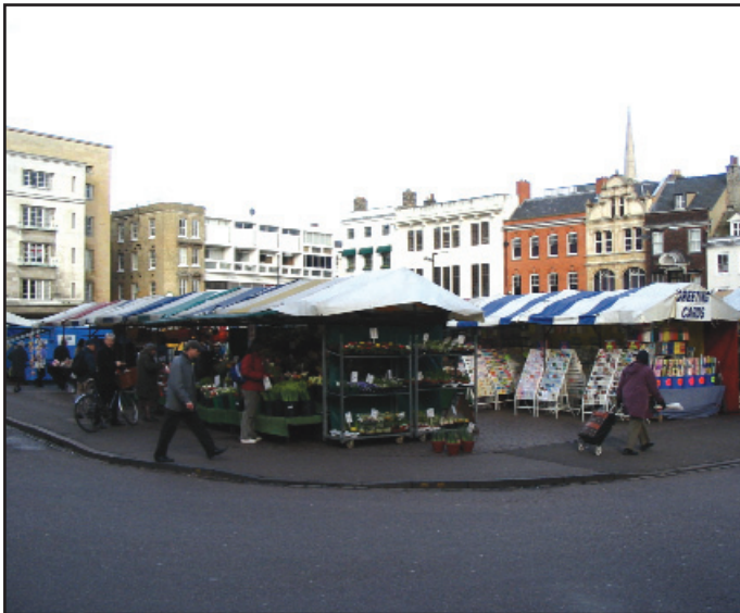
Market trading pitches

Both streets are within the core traffic zone and therefore, virtually pedestrianised for most of the day. St Mary's Street is a mixture of religious buildings, student accommodation, shops and commercial buildings. Market Street is similar but far more commercial being one of the main shopping streets. There are also coffee bars and less student accommodation.