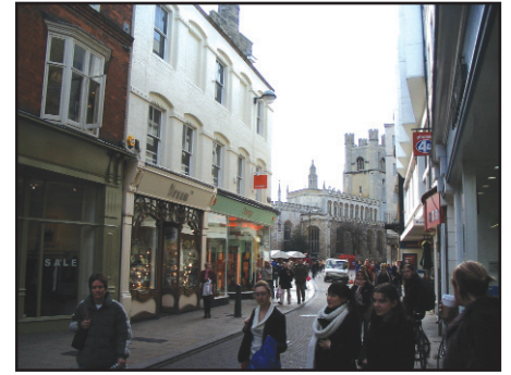
View along Market Street

commercial nature of the street which still dominates Market Street today, whilst St Mary's Street is dominated by Great St Mary's Church.