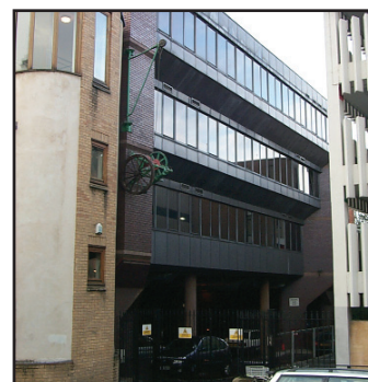
Bridge House / Park Street car park