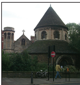
Holy Sepulchre Church