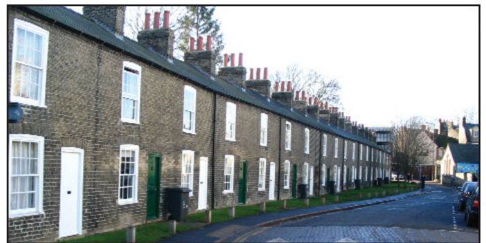
View along Lower Park Street