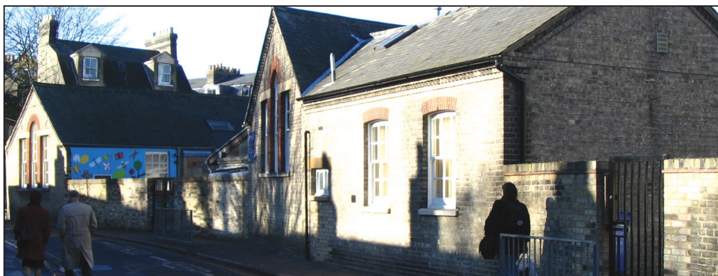
C of E County Primary School

Additional planting in the school playground would soften the severity of the school boundary.