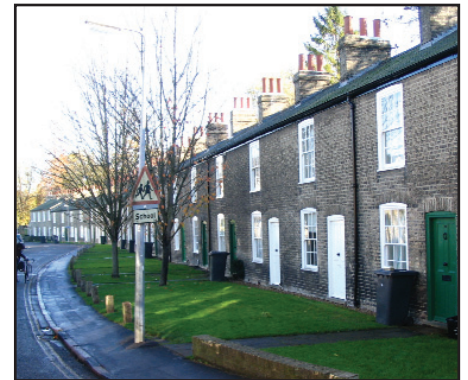
View along Lower Park Street

south side of the street was built by Jesus College for its servants in the early nineteenth century. Today, the street is an important pedestrian link to Jesus Green.