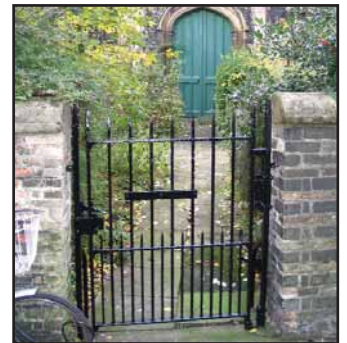
St Botolph's Church gate