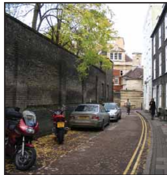
Corpus Christi College wall