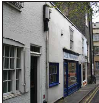
Shops along Botolph Lane