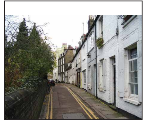
View east along Botolph Lane

continuous row of small domestic buildings on the south side and Corpus Christi College buildings and St Botolph's Church on the north side.