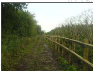
2 bar Post and Rail Fencing