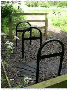
New Cycle racks - at the Barnwell Road entrance