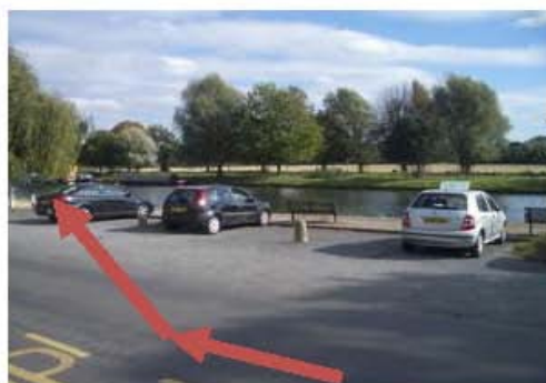
Image showing the natural desire line for entry to the path, currently blocked by the end car parking bay. Removing that final bay would avoid the need to route cyclists round the back, creating conflict with walkers.

This would mean that the natural diagonal desire line into the path is catered for (see photo), and would make the start of the towpath cycle route look more attractive.