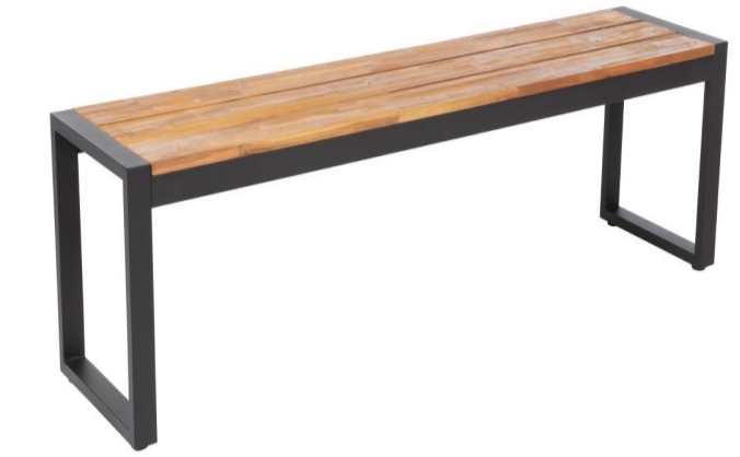
2. TIMBER & STEEL BENCH 1200 X 380M