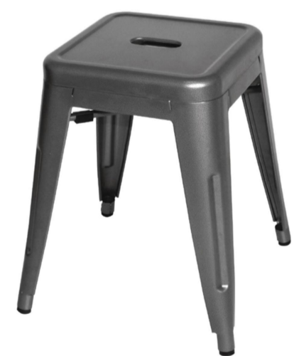
4. 310 X 310MM METAL STOOL