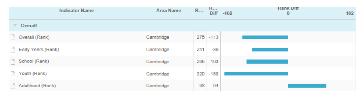
Table 1: Overall ranking for Cambridge and rankings for component headings

The overall index can mask a lot of variation across the different components of the Index. Many local areas that do well in terms of ranking in the Index can perform relatively badly in some components. Similarly, many local areas that do badly in the Index overall can have areas of real strength. For example, where educational outcomes for young people from disadvantaged backgrounds are relatively poor, strong job markets can provide more opportunities for young people from disadvantaged backgrounds to do well as adults.