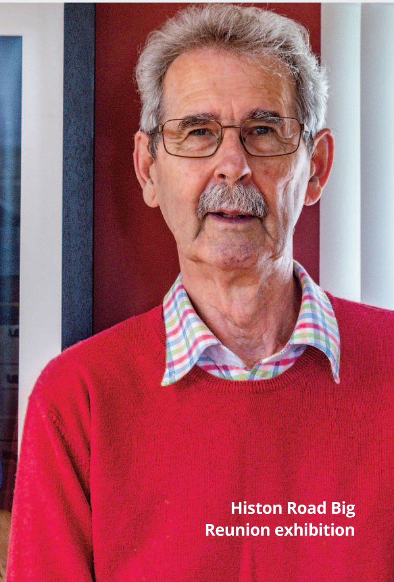
Histon Road Big Reunion exhibition