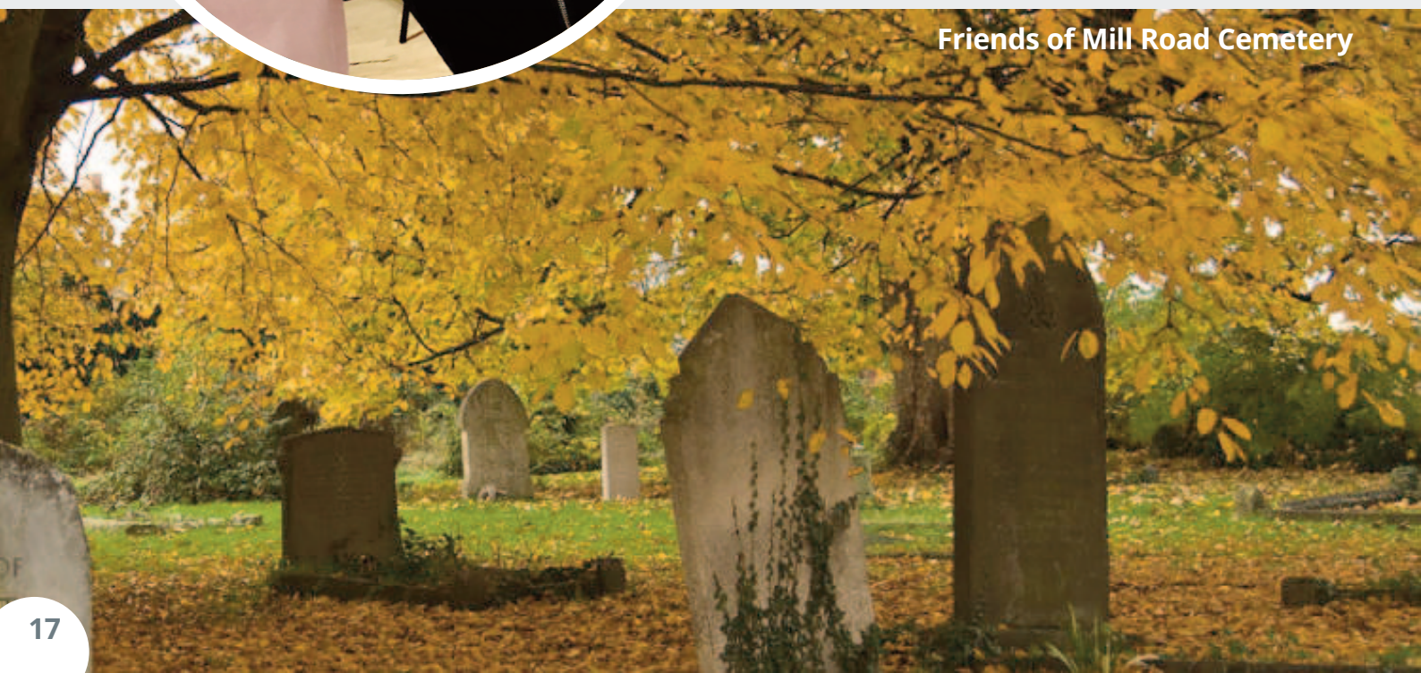
Friends of Mill Road Cemetery