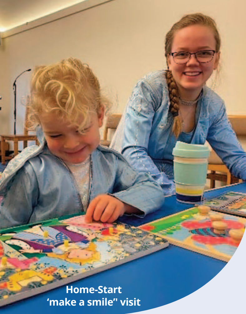
Home-Start ‘make a smile’ visit