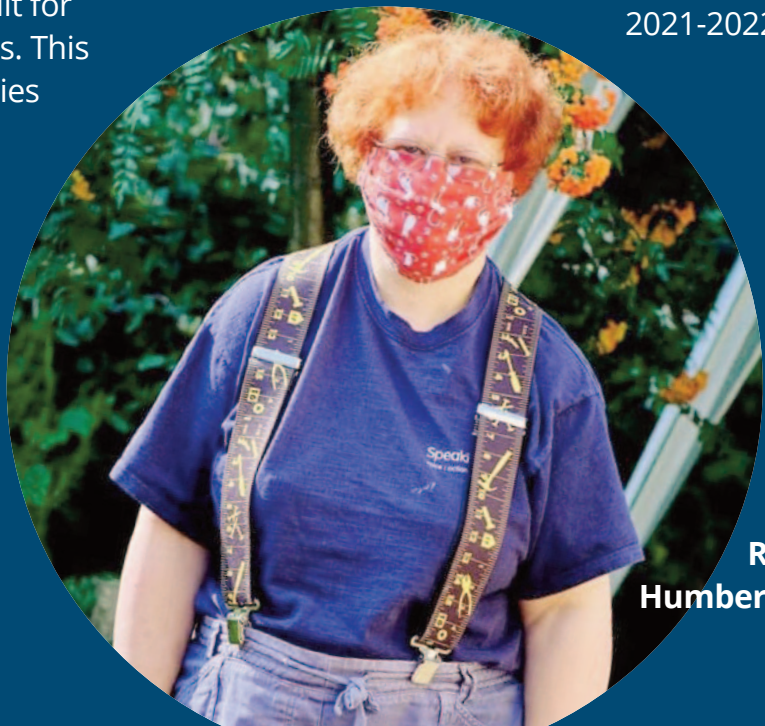
Rowan Humberstone Ltd

Despite the challenges during the pandemic, 89 groups were funded and 108 activities delivered during 2021-2022.