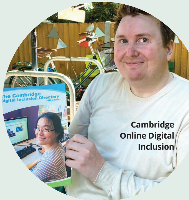
Cambridge Online Digital Inclusion